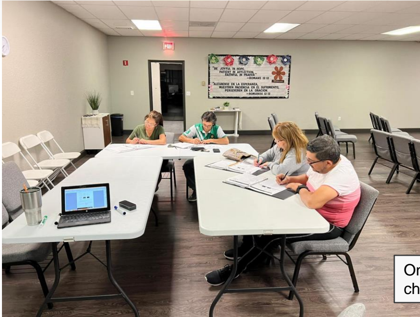
One of our group classes at the church building in Coral Springs.