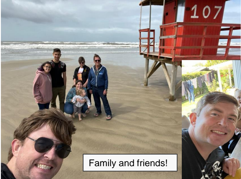
Family and friends!