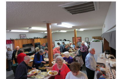
This picture was taken on 11/12/2017 at our Thanksgiving Fellowship.

Sunday is our 1st Sunday Fellowship following worship at 5:00. The Hill/Thompson/Kennington Family Life Groups are in charge of setting and cleaning up. The menu is potluck.