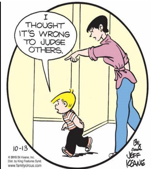
10-13 "Sorry, that doesn't apply to your mother." Bill and Jeff Keane