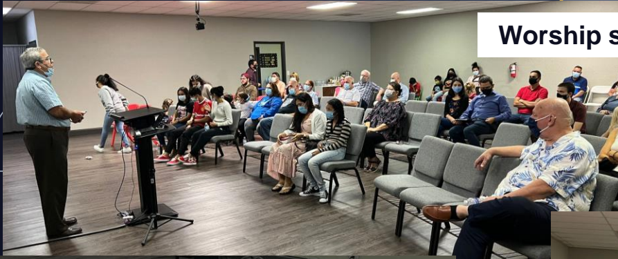
Worship service on Sundays.