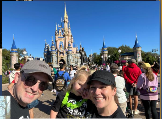
Our first ever trip to Disney World!