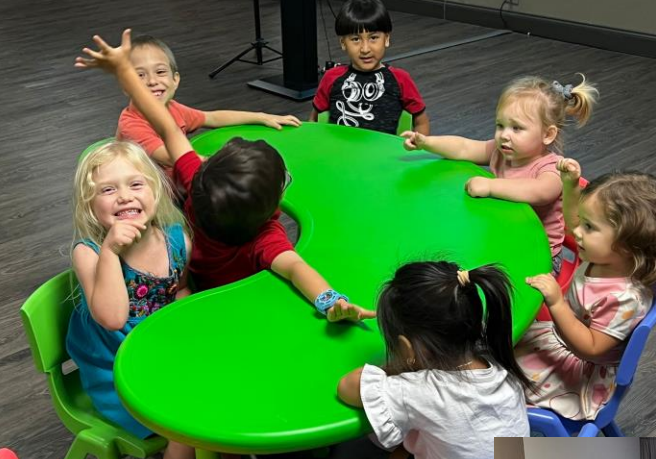
Some of our kids!