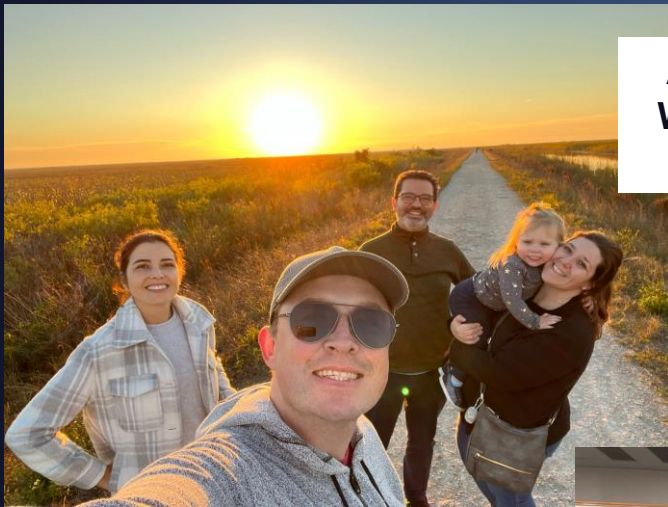
Admiring God's amazing creation. We took the Liras to see the sunset at the Everglades.