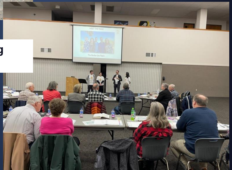
Meeting with our sponsoring churches in Searcy, AR.